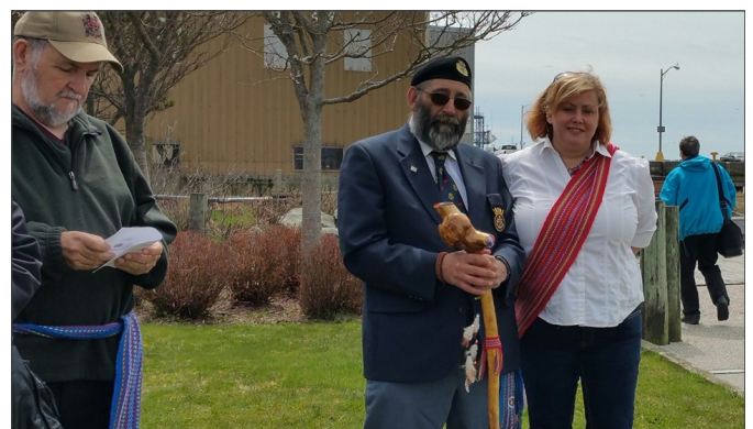
Battle of the Atlantic Ceremony 2016