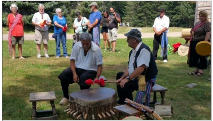
Port Royal, August 21 2016