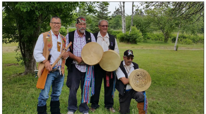
Aboriginal Day, 2016