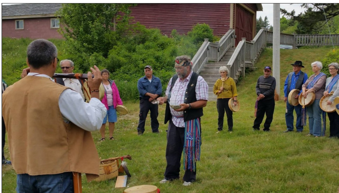
Aboriginal Day, 2016