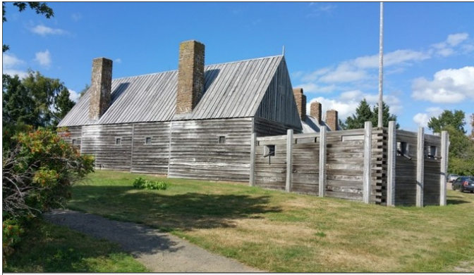
Port Royal, August 21 2016

Here are a few photos from some of the activities and events AAMS members were involved in this year