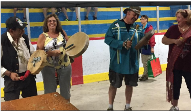
AAMS booth at the Festival Acadien de Clare