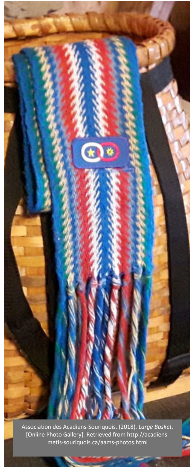
Association des Acadiens-Souriquois. (2018). Large Basket . [Online Photo Gallery]. Retrieved from http://acadiens-metis-souriquois.ca/aams-photos.html

Members If you have any story ideas, messages or photos you would like included in the AAMS Newsletter, please contact the AAMS Office. Members are asked to submit interesting photos for the AAMS social media campaign. The photos must be of typical Acadiens-Métis food, hunting, fishing, trapping, clamming, quilting, organic gardening, activities and locations... things taught by grandma and grandpa. A one-line photo description or caption must accompany the photo as well as the name of the photographer. Please email your photos to aams.office@gmail.com