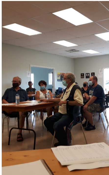
Part of the audience at the 2021 AGM. (Notice the social distancing rules being observed.)