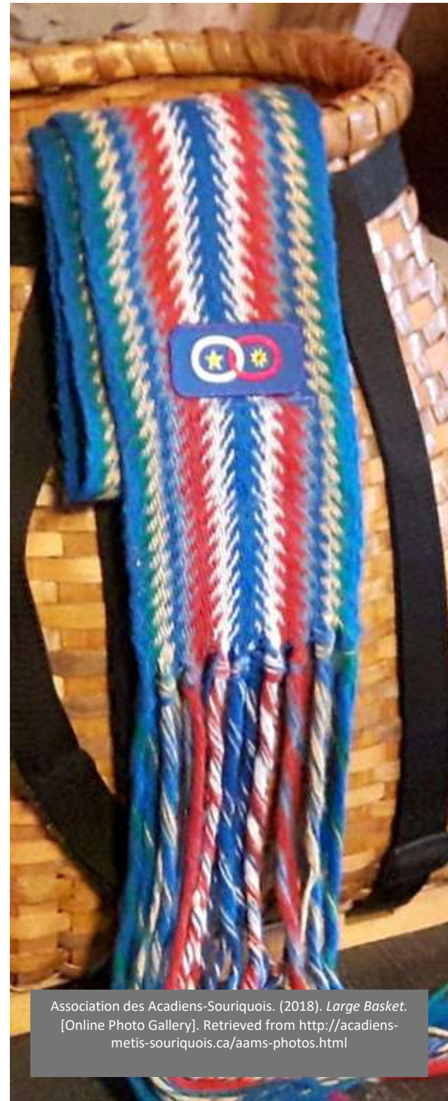
Association des Acadiens-Souriquois. (2018). Large Basket . [Online Photo Gallery]. Retrieved from http://acadiens-metis-souriquois.ca/aams-photos.html

For more info on Mitacs, see: https://www.mitacs.ca/en